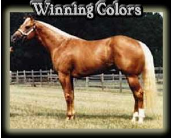
Owned by: Admiral Equine Services Lake Geneva, WI

Palomino Stallion Foaled in Indiana in April of 1988